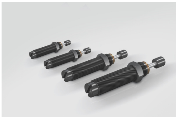
Picture 4 ACE MC5-MC75.tif

Self-adjusting miniature shock absorbers from the MC5 to MC75 series made by ACE with thread sizes from M5x0.5 to M12x1 for the reduction of effective weights between 0.5 kg and 72 kg