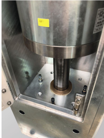
Picture 3 ACE MC at FFB and Meyra drop test unit absorbers.jpg

The impact plate itself must not impact, which is why four ACE miniature shock absorbers reliably and precisely reduce the mass forces to protect the overall structure