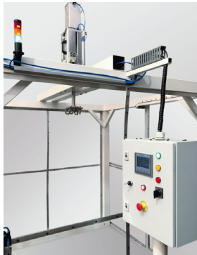
Picture 1 ACE MC at FFB and Meyra drop test unit.jpg

Drop test unit for testing the stability of wheelchairs with controls in the foreground on the right and the pneumatically operated construction for engaging and disengaging the wheelchairs at the top